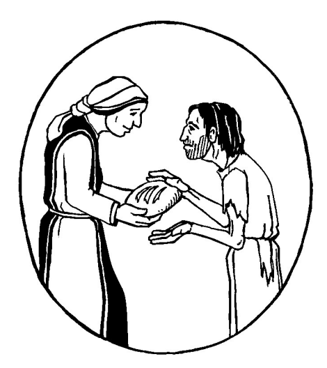
For all creation